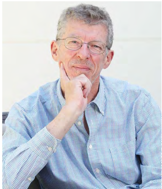
Professor Ian Frazer